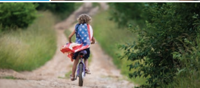
The pursuit of healthiness goes well beyond hospital care. It's about helping our community thrive.