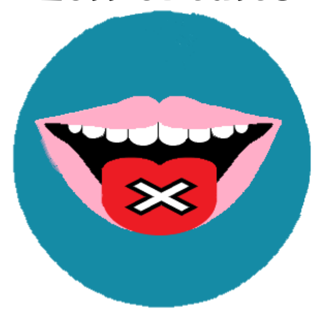
Loss of taste Sore Throat