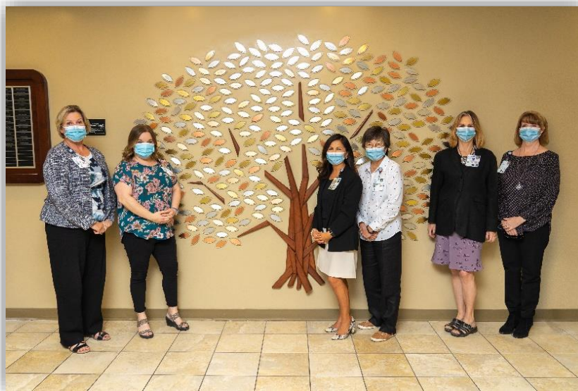
The New Heritage Club tree, located in the hospital's Acequia Wing Lobby.