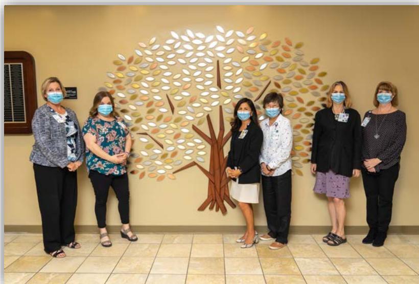
The New Heritage Club tree, located in the hospital's Acequia Wing Lobby.